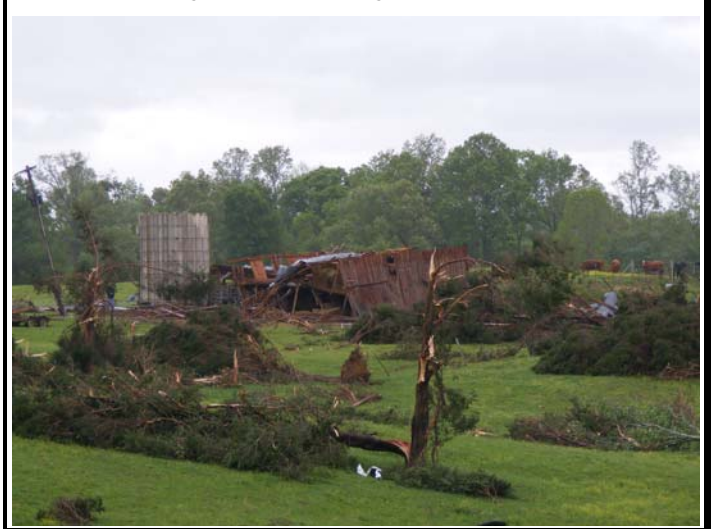
The photo below shows the ruins of barns which were destroyed by the tornado along County Road 750.