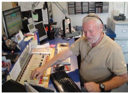
Answering a call on the Trading Post