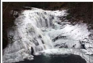
Bald River Falls Covered in Ice.