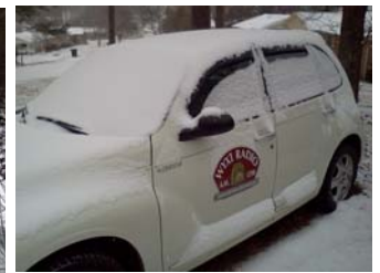
Almost 2 inches of snow fell on the "Wixie-Mobile"