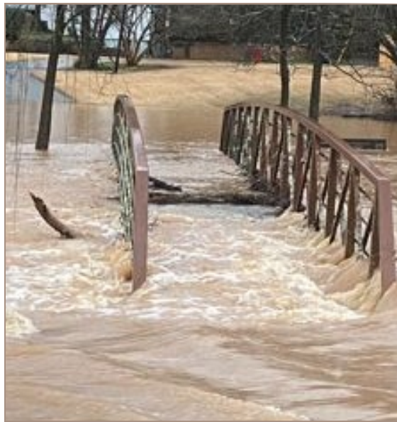
shows the footbridge next to Veteran's Park.

As of Thursday morning, Athens Utilities Board had recorded 5.25 inches of rain since Wednesday. And a few more inches fell on Thursday. All the rain caused a lot of creeks to rise and roads to be covered with water. (More photos below and on page 2)