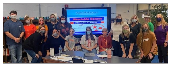
MORE RESTAURANT INSPECTION SCORES

Baker's Place, Englewood - 99 Revival Grounds Coffee Company, Etowah - 99 Scottie's Diner, Etowah - 99 Waffle House, Etowah - 98 GM Pizza dba Dominos - Etowah - 98 County Line Snack Bar, Sweetwater - 98