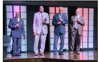
The Mt. Pleasant Baptist Male Chorus