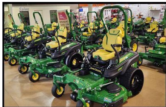
Your local John Deere Dealer

Spring is right around the corner! We have a great selection of mowers to choose from. Stop in and see us.