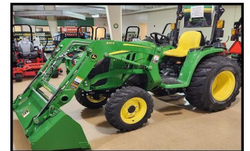
Your local John Deere Dealer

Looking for a Tractor for your Farm? We have you covered with many to choose from. Come see us!