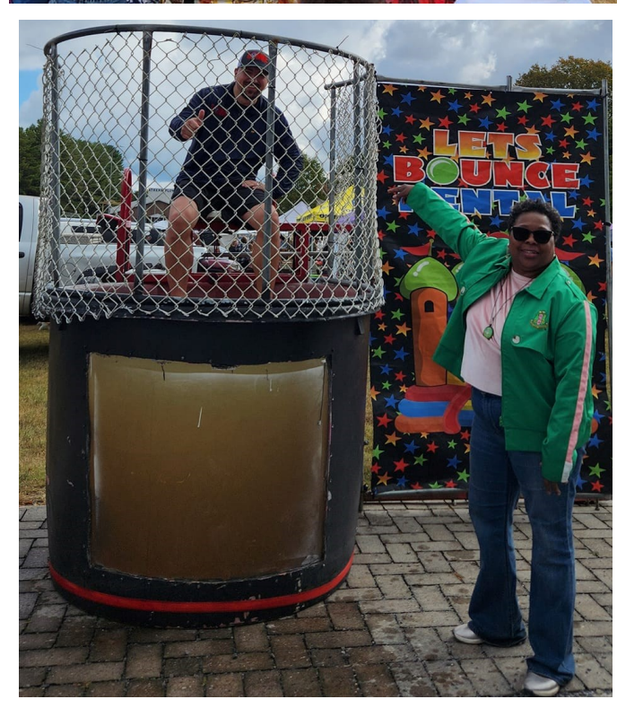
More Photos in tomorrow's edition of the Morning Fax