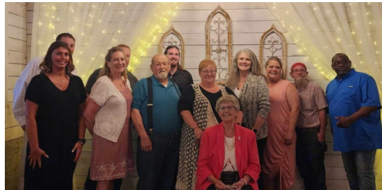
Woman of the Year Mayor Lois Preece, Seated with City of Niota Employees