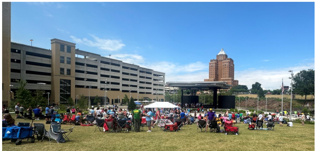
Maynard Performance Pavilion