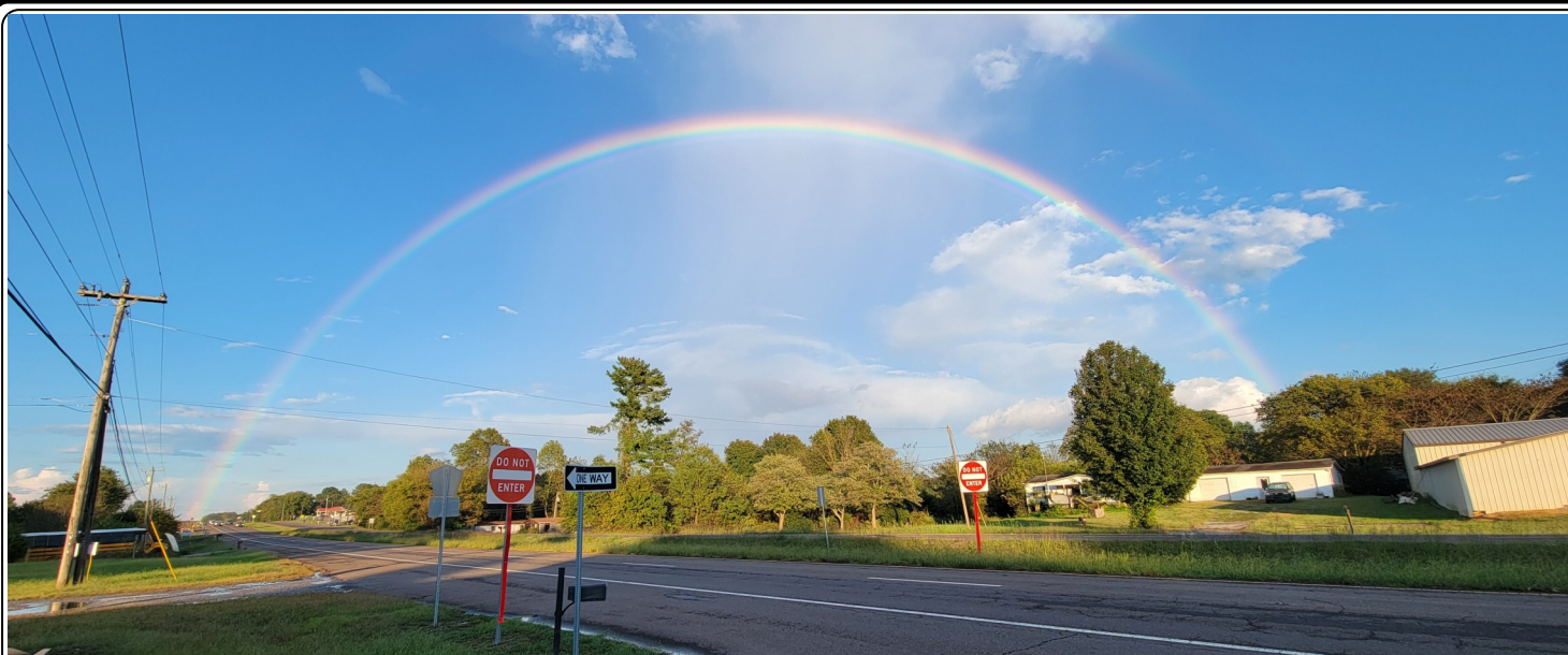
Just In Case You Missed It!